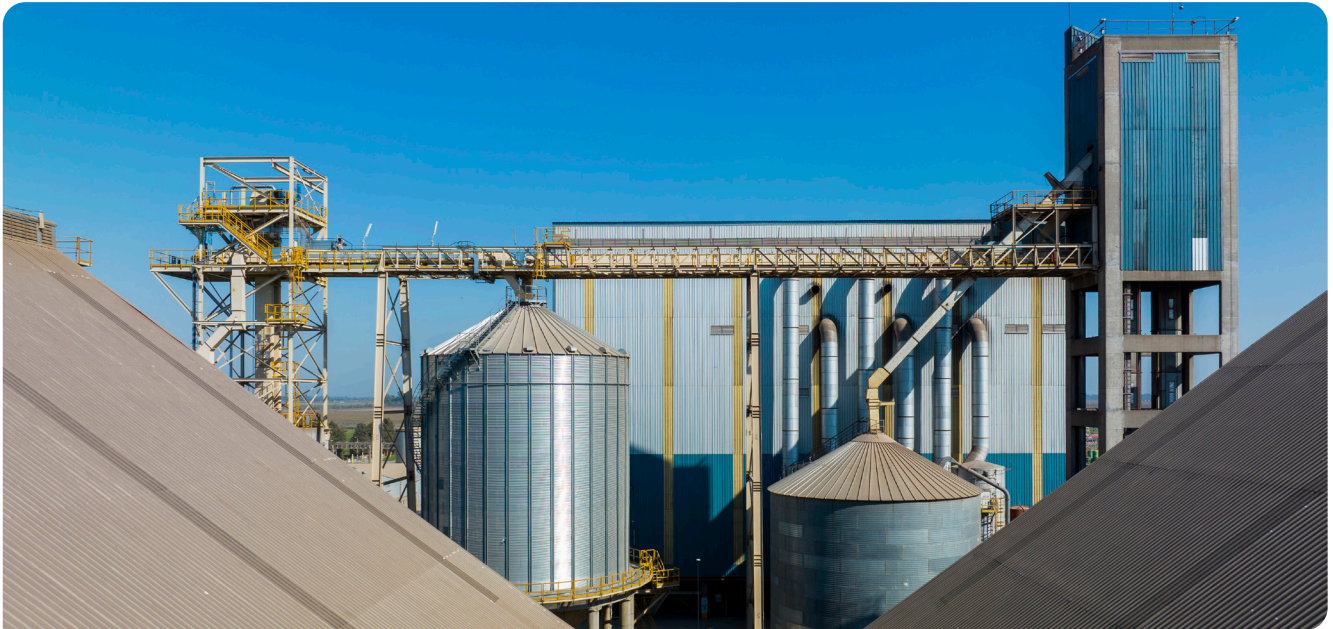
LBIA Enclosed Belt Conveyor, Argentina

COFCO installed three enclosed belt conveyors to feed and discharge the silo that supplies different kinds of soybeans to the crushing plant. Enclosed belt conveyors are also provided with spot filters that are assembled directly onto the conveyor – this results in an absolute minimum of suspended dust inside the conveyor, and much higher hygiene standards overall. Reducing the amount of dust in the surrounding air also cuts the risk of explosion. So not only does an enclosed system boost food hygiene, it also enhances the safety of the plant as a whole.