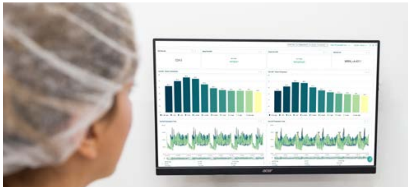
The second level involves applying algorithms to analyze and monitor the collected data.

Timescale: Level 4 is currently at the vision stage.