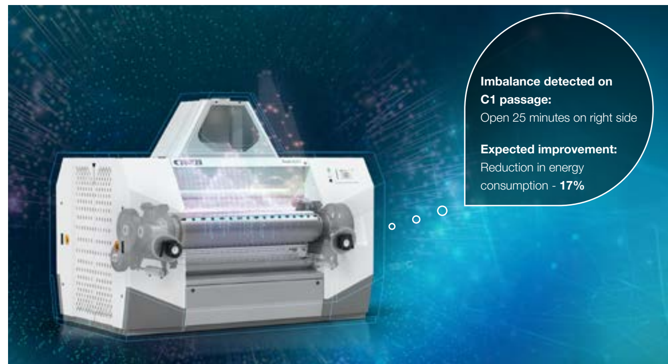
Through continuous monitoring and analysis, the Grinding Gap Optimization recommends adjustments to optimize product quality and energy usage in the milling process.

Picture your operations infused with intelligence, where insights become decision-making power. Join us on this captivating journey to shape the industry’s future. Together, we will not just reach for the next level in milling – we will set it.