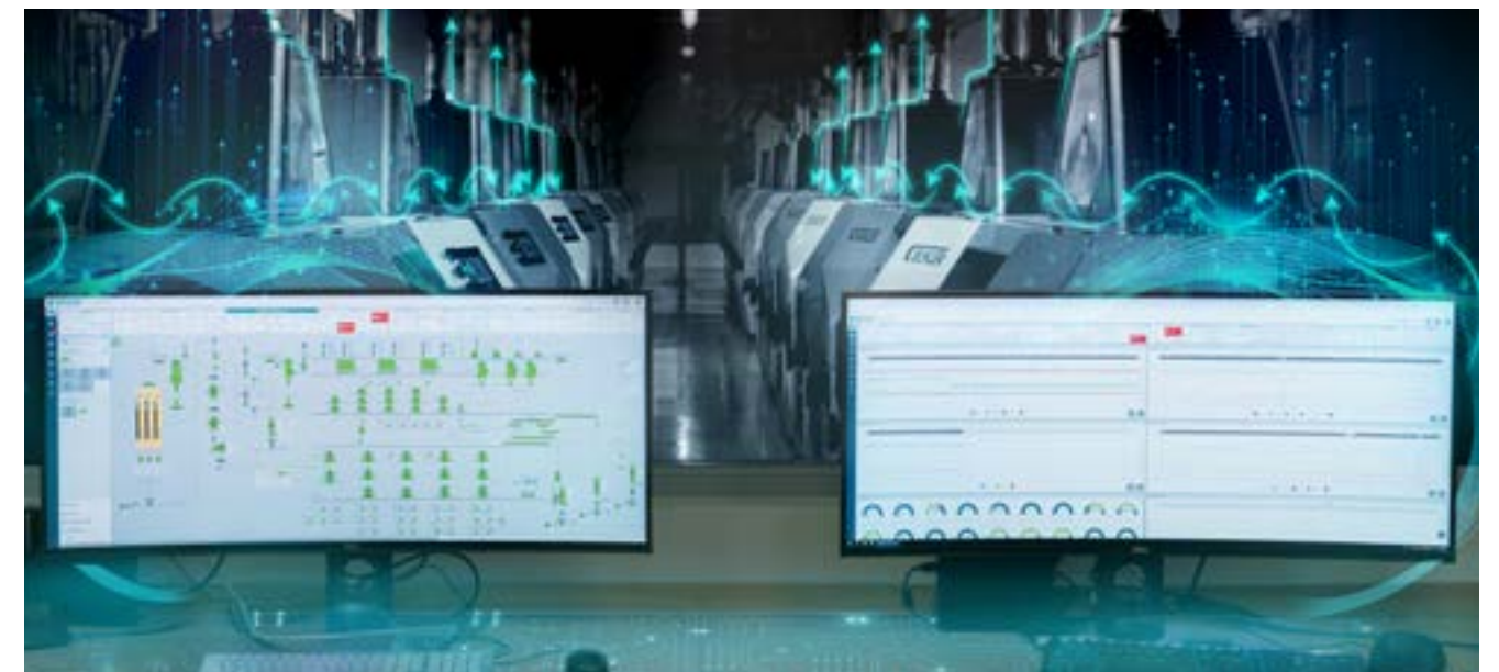
The Assist level reduces human intervention through individual real-time, self-optimizing production processes.