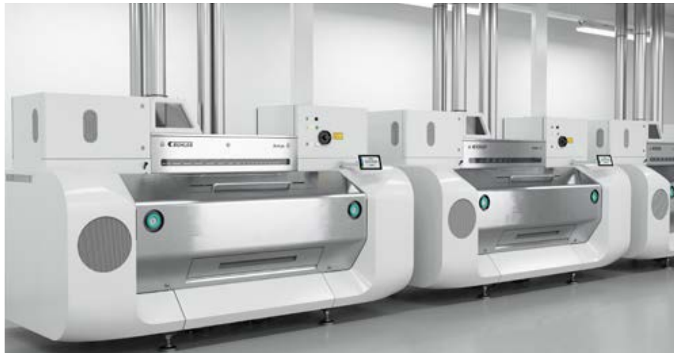
A prerequisite for SmartMill is equipment able to make production data digitally available, one such example is the IGS Arrius.

Algorithms were then applied to the data to analyze the impact on yield and quality between plants and over time. This comparative analysis enabled a skilled mill operator to take decisions that improved plant and product performance. As Bühler is collecting more and more production data across the milling industry, it is now possible to go a step further and develop prototypes that predict production outcomes depending on variables like grain type and moisture content. These digital innovations can now make autonomous adjustments to production parameters to optimize individual milling steps in real time. Today these prototypes only cover certain parts of the milling process. Once autonomous processes are developed and combined to cover the whole production process from intake to bulk-load or packing, we will have reached our destination, the SmartMill.