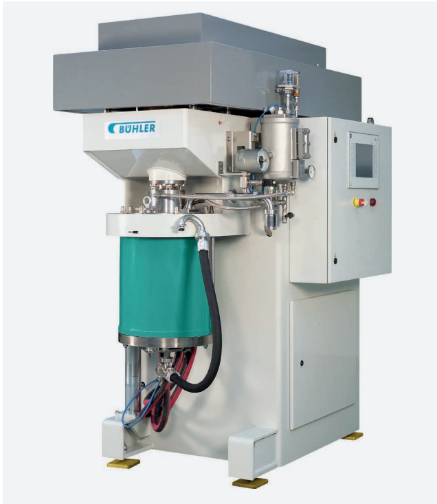
MicroMedia X with the new Invicta process chamber