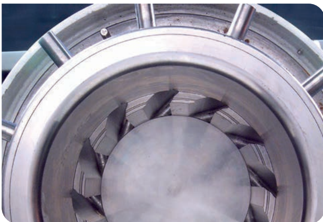
View into the process chamber

Compared to the MicroMedia X, you can reduce the specific energy input by up to 25%, cut the running time in half and double the flow rate. Invicta now delivers the same high product quality as MicroMedia X, using significantly less energy. And although the chamber is slightly longer, it still fits the same footprint on your factory floor.