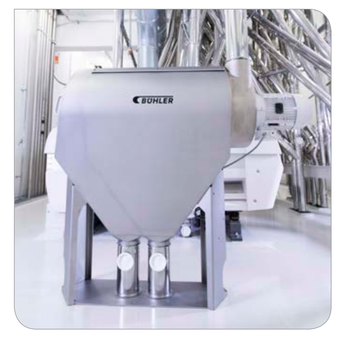
High capacity and optimum hygiene thanks to new design and direct drive