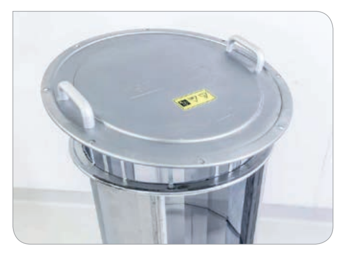
The screen of the stainless steel sieve frame can be exchanged.

Easy maintenance. Outstanding accessibility for regular production checks.