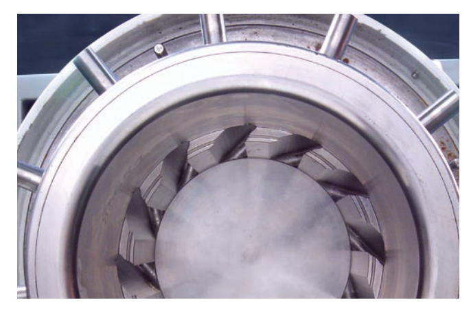
View inside the MicroMedia X process chamber

With this conversion kit, Bühler makes it possible to benefit from the process engineering advantages of the MicroMedia X, even for older machine systems (Advantis, Cosmo and SuperFlow). For this purpose, an individual conversion package is put together that reduces conversion costs to