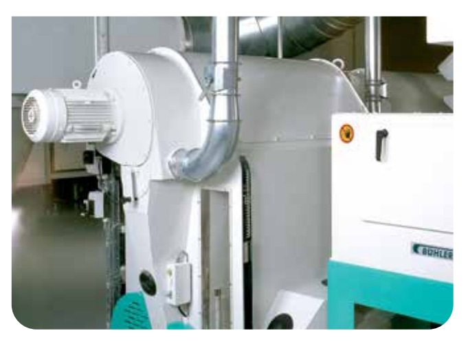
Air-recycling aspirator MVSQ: neat separation of the detached fragments.